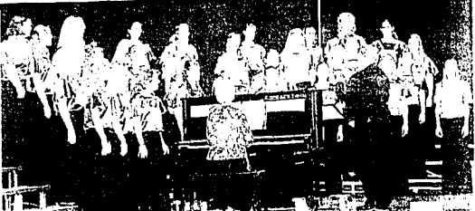
The Weiser High School Treble Choir presented Jesu, Joy of Man's Desiring, Caroling, Caroling and Lo, How a Rose E're Blooming during their Christmas Concert recently.