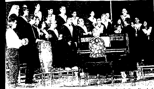
Weiser High School Concert Choir presented Gloria, One Bright Star, Carol of the Bells and African Noel for their Christmas concert.