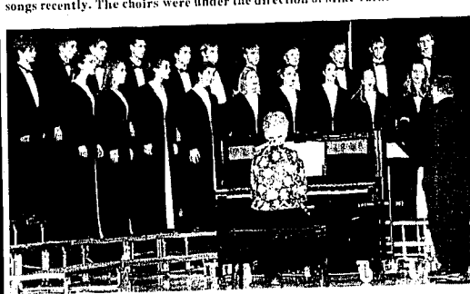
Weiser High School Chamber Singers presented a beautiful performance during their recent Christmas Concert with four tunes, Coventry Carol , I Remember December , Let It Snow and Silent Night .