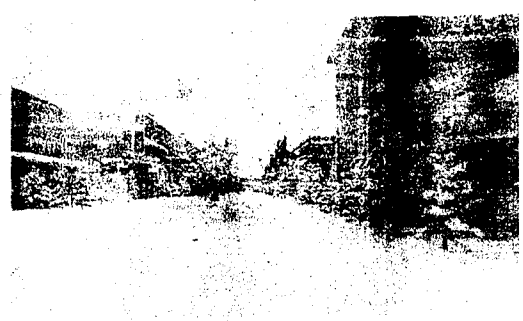
This early 1900s downtown Weiser photograph captured the beautiful winter wonderland scene.