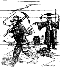
THE PRESIDENT SIGNED LAST WEDNESDAY

The President signed the bill on Wednesday last, and it is now a law. The bill is the most important one since the war, and it will have a great effect on the country.