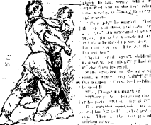
THE MAN WHO WAS THE BARRIER

CHAPTER I. OF THE BARRIER AND THE BARRIERERS. I had a very good breakfast this morning. The coffee was excellent, the toast was just what I needed, and the butter was rich and creamy. I was sitting at the table, looking out at the garden, when I saw a man walking towards the house. He was dressed in a dark suit and a hat, and he looked like a stranger. I got up and went to the door to see who it was. It was a man I had never seen before. He looked at me for a moment and then he spoke.