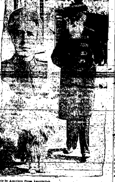
WEST KEEPS ON REFORMING

The late founder of the Salvation Army and his successor are shown in a portrait. The founder is depicted in a military-style uniform, and the successor is shown in a more formal suit.