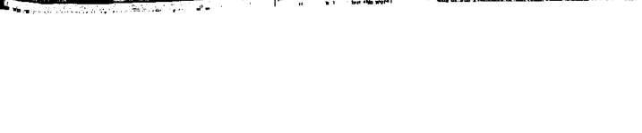
View of the Lane Creek project showing the irrigation canals and the land being brought under irrigation.