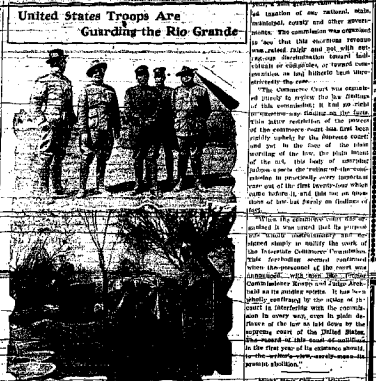
United States Troops are guarding the Rio Grande.

United States Troops are guarding the Rio Grande. The soldiers are seen in various poses, some standing at attention, others in conversation. The background shows a natural setting, likely near the border.