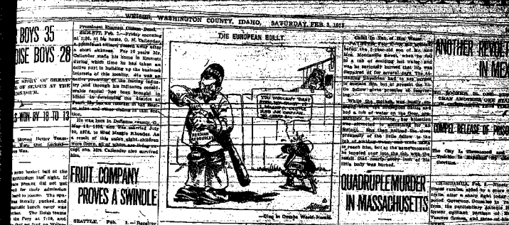
BOYS 95 BOYS 28