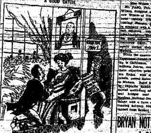
A BOOB CATCH... (caption for the illustration)