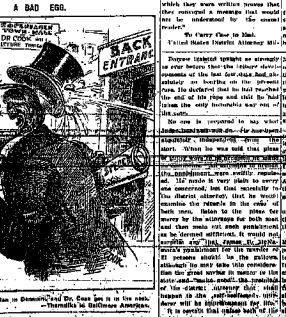
There was something in the air when the Signal was published on Monday.

The United States government is determined to get at the bottom of the dynamite conspiracy which has been active in Idaho for some time. The government is determined to get at the bottom of the dynamite conspiracy which has been active in Idaho for some time.