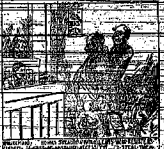
...the ... of ...