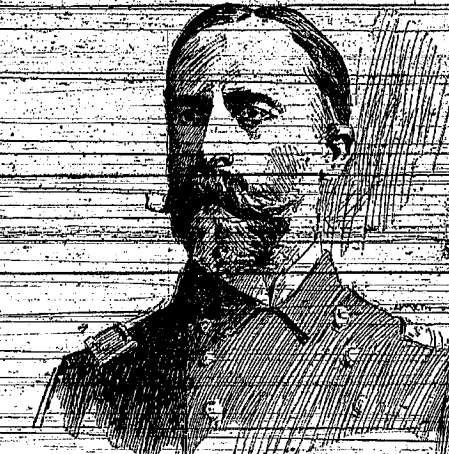
REAR ADMIRAL WILLIAM F. SAMPSON.

There is little doubt for complaint over the way the people turned out to Water's celebration this Fourth, and we think while a finer more might have been done for their amusement, the visitors were a whole-some assembly with the "punch" which was served.