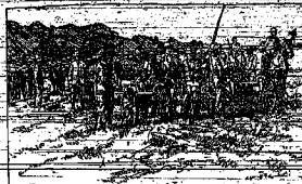
SPANISH ARTILLERY IN THE FIELDS NEAR HAVANA.

VOL. VII WEISER, ILLINOIS, THURSDAY, MAY 24, 1918