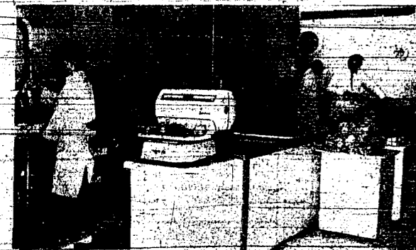
FAMILY FOOD SERVICE PROCESSING PLANT... best is cut to your specifications, wrapped and blast-frozen for safe storage under modern sanitary conditions. Note the spotless condition of the work area. FAMILY FOOD SERVICE expert cutters give personalized attention to your requirements, making it possible for you to produce better meals with greater variety for your family's eating pleasure.

Former Weiser Food Center Building Across From Hotel Washington