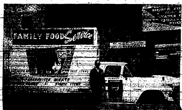
FAMILY FOOD SERVICE REFRIGERATED TRUCKS are loaded direct from zero storage facilities with a minimum of handling in order to maintain low, safe temperatures from the plant to your Blue Ribbon freezer. This absolute control is vital to freshness, quality and flavor. FAMILY FOOD SERVICE proven formula is designed to help you and your family enjoy better living in the MODERN... SAFE, CONVENIENT way.

A Nation-Wide Service From Coast To Coast